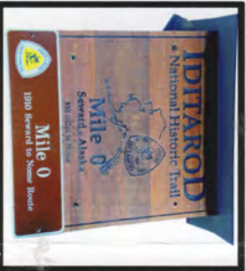
E. Mile Zero