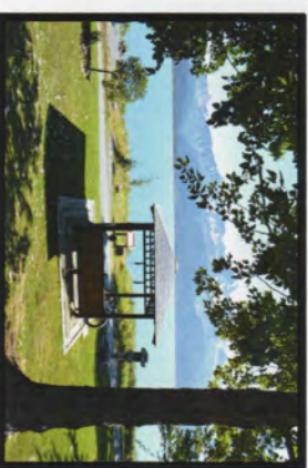
G. Japanese Gazebo