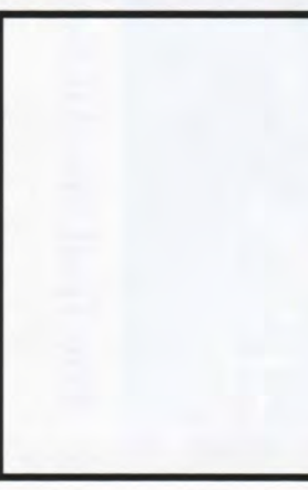
I. Mile 0 Stamp *