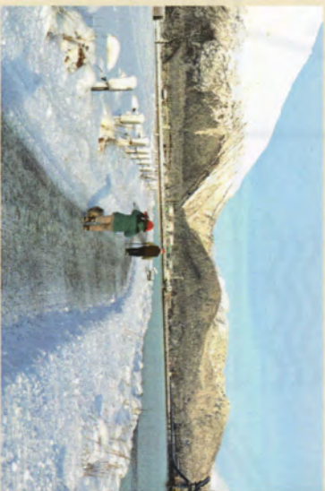
The Trail For All Seasons

In 1978 Congress designated the Iditarod Trail from Seward to Nome as the first National Historic Trail.