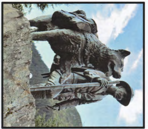
A. Trail Blazers

* To learn more about the Iditarod Trail, visit the Seward Community Library and Museum at 239 Sixth Avenue.