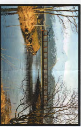
H. Scheffler Creek Bridge