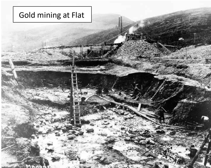
Gold mining at Flat

“The John Beaten dredge will resume on Flat Creek, and likewise the Riley Investment Company dredge on Otter Creek.”